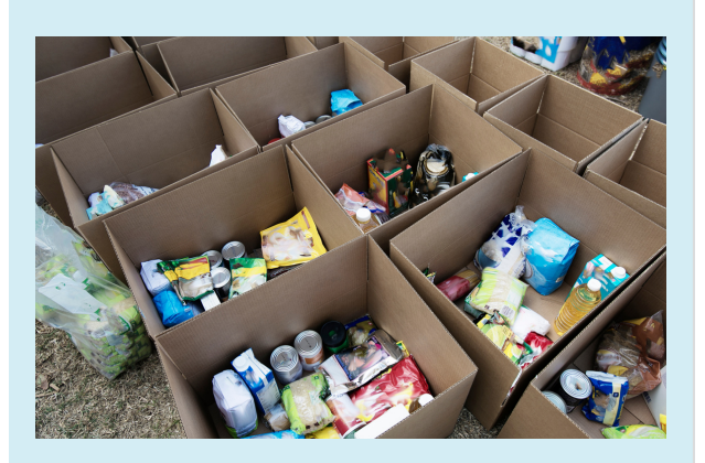
Step 3: Create Your Donation Box

Now, it's time to set up your donation box! Use a sturdy box or bin, and add some clear signage that explains what the drive is for and what types of items are accepted.